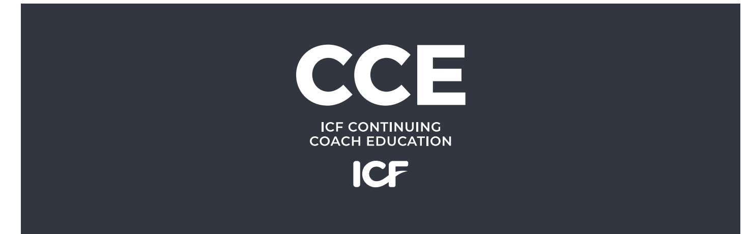
Solid reverse White mark on neutral or dark colored backgrounds